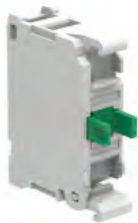
UP/DOWN SWITCH CONTACT HEL1042