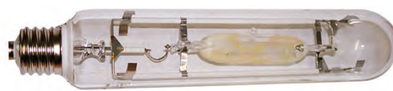
SMC TL35, TL90 LAMP HEL0434