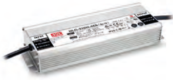
LED DRIVER UNIT HEL2053