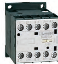
MINI-CONTACTOR 12V 20A HEL2074