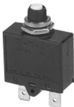
12A CIRCUIT BREAKER HEL1004