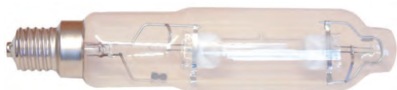
VT1 LAMP HEL0428

Plus the Superbright® lighting system - The easy-to-fit head that can be fitted to a VB9 in minutes!