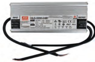
LED DRIVER UNIT 24V 320W HEL2083