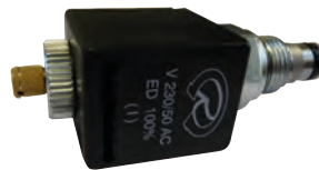
MAST LOWERING/RELEASE VALVE HEL0672