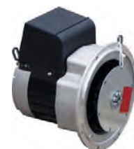
GENERATOR 3.5KVA HTL0919