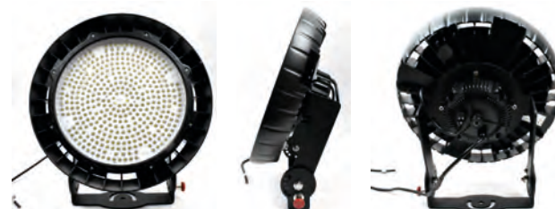
VB9 LED HEAD & BRACKET HEL0310